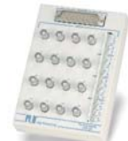
Model 070C29 16-channel Patch Panel IDC and BNC in, DB50 out