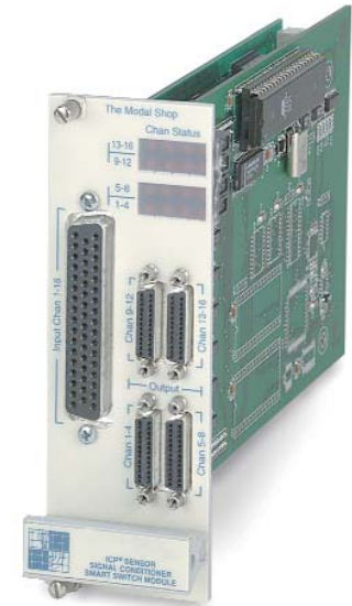
442 Family 16 Channel ICP ® Input Module

Pre-filter: Module allows selectable 2-pole pre-filters set to 100 Hz, 500 Hz, 1 kHz, or 30 kHz for more effective ranging/resolution in your acquisition. Custom filter settings are available as an option.