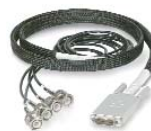
Model 009L05 VXI to 4-BNC