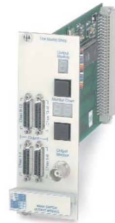
Model 441A175 Bank Switch

This module collects and outputs 16 signals at a time from the signal conditioners modules. Bank switching can be performed by computer control or manually from the front panel. The output connections are the standard Agilent E1432 VXI connectors. A BNC jack connection on the front panel outputs 1 of the 16 channels. This 'monitor' channel can be used for quick checks of signal levels and quality, selected via a front panel push button or computer control.