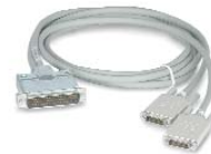
Model 009P05 2-VXI to DB50